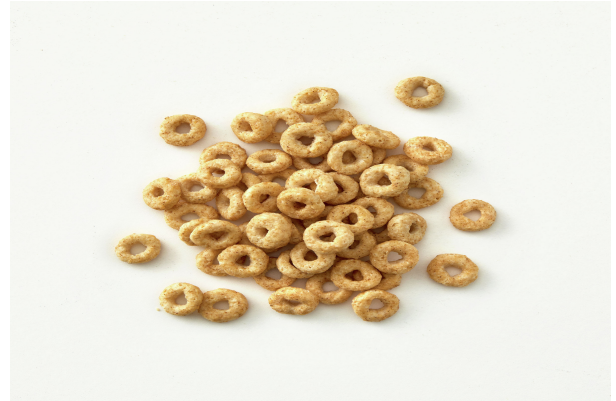
PIM - Out of Packaging