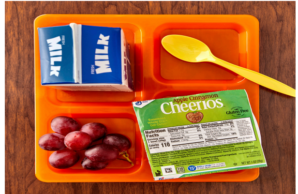
PIM - Styled