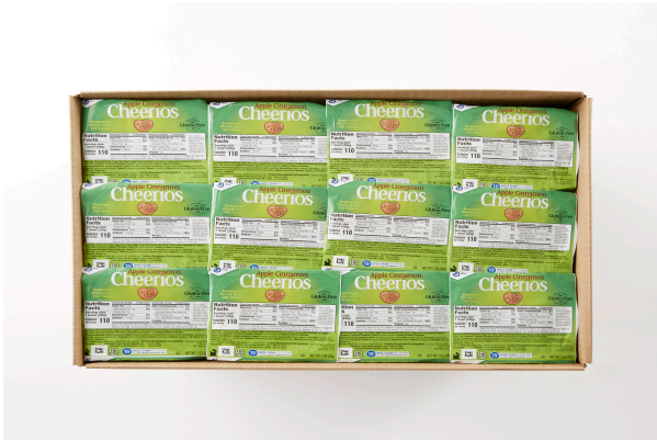
PIM - Open Case