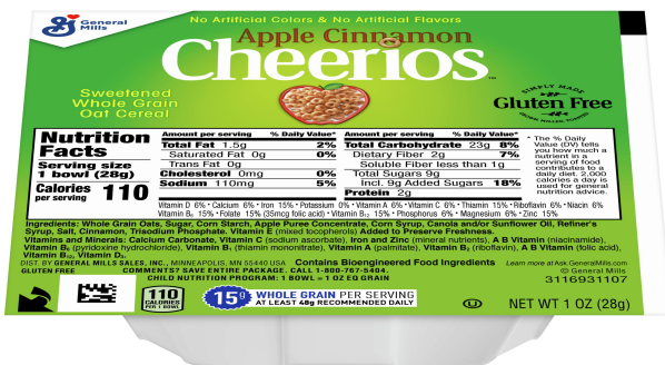
Front - 3D