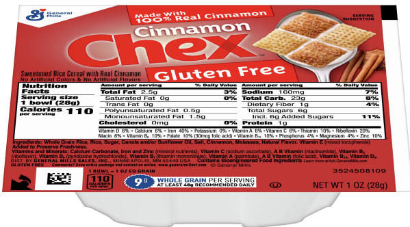
Front - 3D