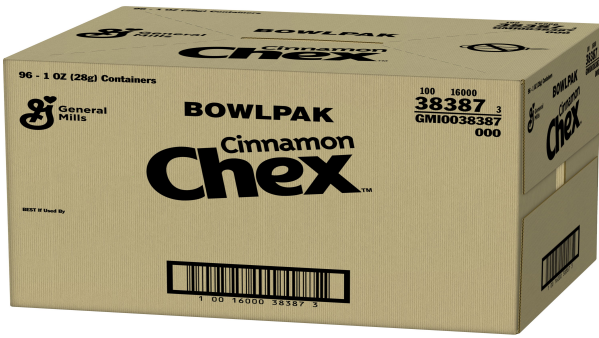
Case - Right Front 3D