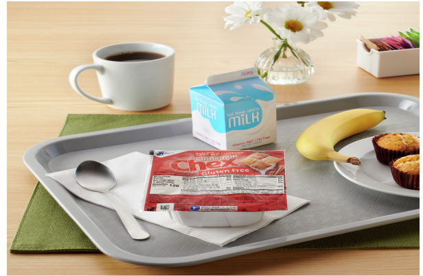
PIM - Styled