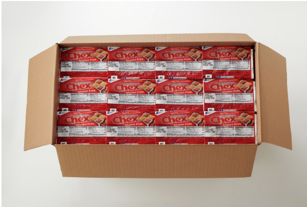
PIM - Open Case