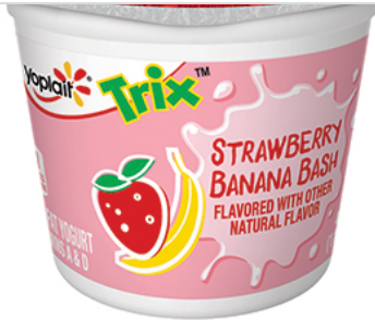
Yoplait® Trix™ Gluten Free Yogurt Single Serve Cup Strawberry Banana Bash (48 ct) 4 oz