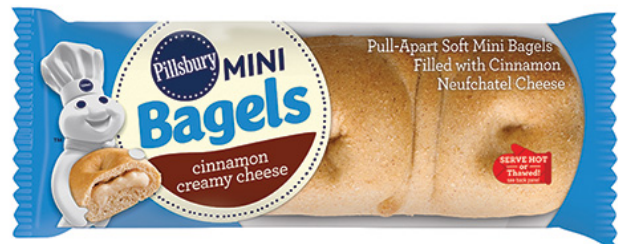
Pillsbury™ Frozen Mini Bagels Cinnamon Creamy Cheese 2.43 oz

Nutritional information is subject to change. See product label to verify ingredients and allergens.