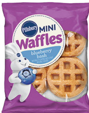
Pillsbury™ Frozen Mini Waffles Blueberry Bash™ 2.47 oz