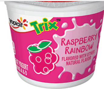
Yoplait® Trix™ Gluten Free Yogurt Single Serve Cup Raspberry Rainbow (48 ct) 4 oz