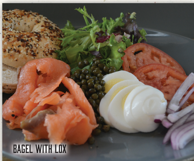
BAGEL WITH LOX

Bacon / Ham / Onions / Green Peppers / Mushrooms / Monterey Jack Cheese 8.99