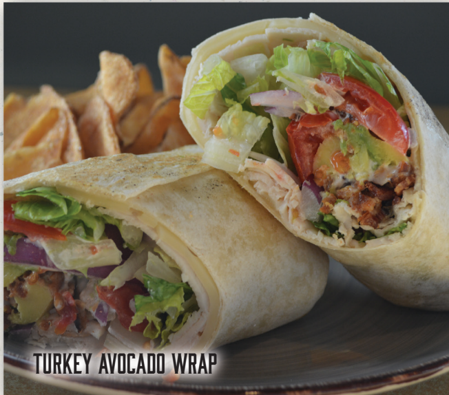
TURKEY AVOCADO WRAP

Turkey / Avocado / Bacon / Lettuce / Tomato / Onion / Mayo / Swiss Cheese 11.49