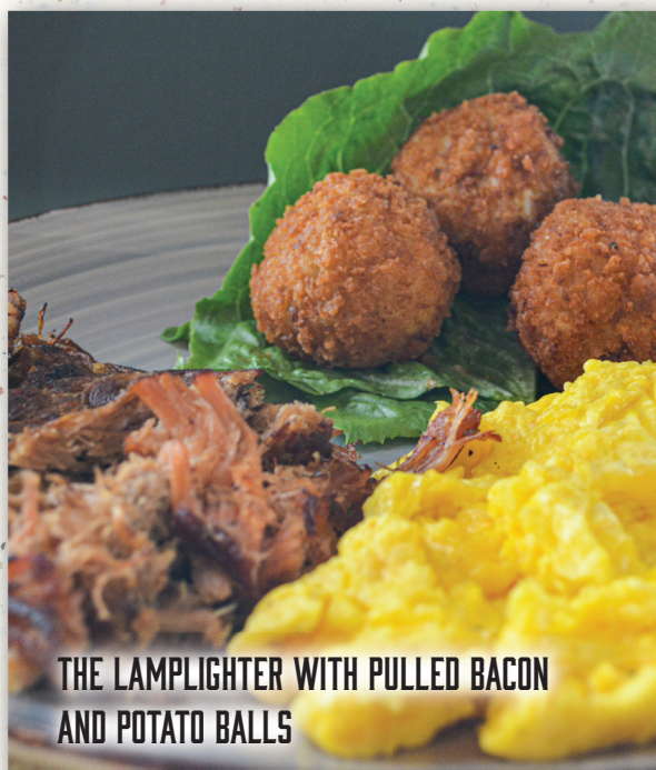
THE LAMPLIGHTER WITH PULLED BACON AND POTATO BALLS