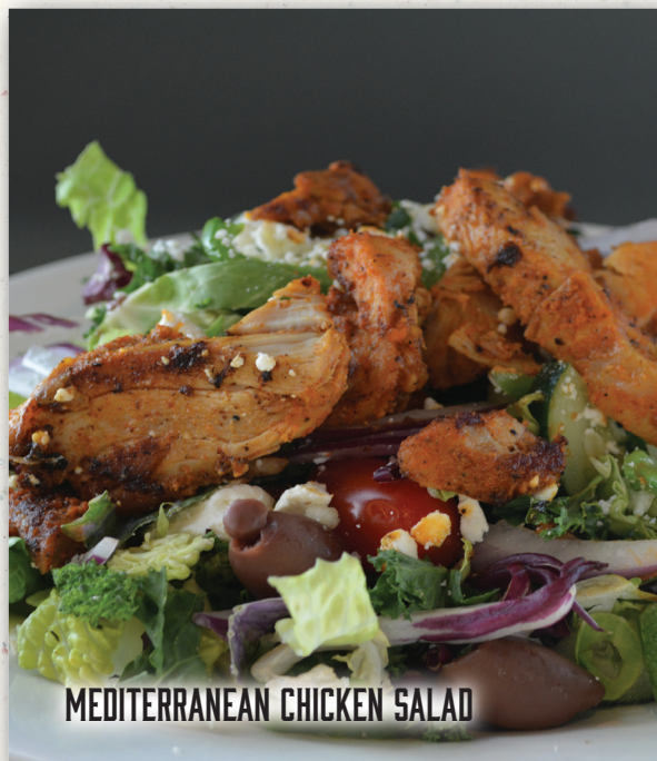
MEDITERRANEAN CHICKEN SALAD

Mixed Greens / Bacon / Dried Cranberries / Apples / Candied Pecans / Blue Cheese Crumbles 10.99